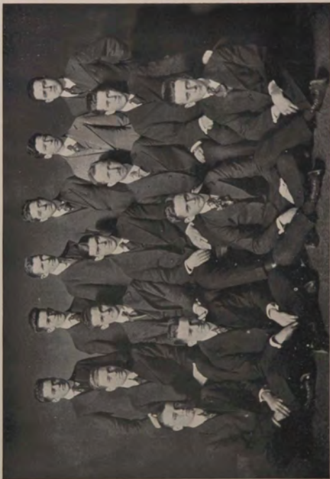
THE BEACON BOARD