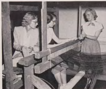
Warping and shuttling

In expanding the undergraduate and research programs in all areas of Home Economics, the college has facilities for major work in: Child Development and Family Relations; Foods, Nutrition and Institutional Management, Teacher Training in Home Economics; Textiles, Clothing and Related Arts.