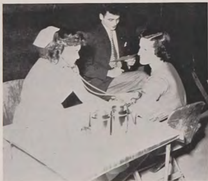
Helping at the blood bank

A curriculum was established in 1945 to include college courses in the arts and sciences, and to give training in the basic preparations in all aspects of general nursing. Upon completion, the student receives a Bachelor of Science degree and is eligible to take the Rhode Island State Board examinations to become a registered nurse.