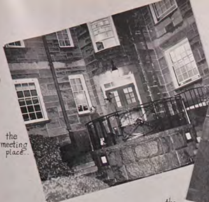
the meeting place..