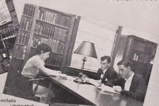
the inevitable consequence... grinding