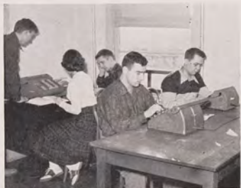
Facts and Figures

Offering professional and technical instructions in theoretical and applied economics, organization, application and regulation of business institutions, the College of Business Administration has schools in: Accounting, Marketing and Advertising, Insurance, Economics, Industrial Management, Secretarial Sciences, General Administration.