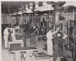
Push the first lever down, the power goes round and round and comes out here.

To meet the increased demands of industry and research, seven curricula are offered in the College of Engineering: Chemical Engineering, Civil Engineering, Electrical Engineering, Mechanical Engineering, Mathematics, Physics.