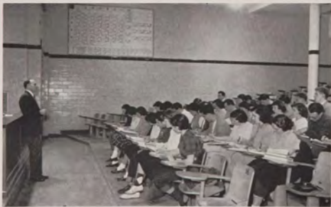
Minds in accord