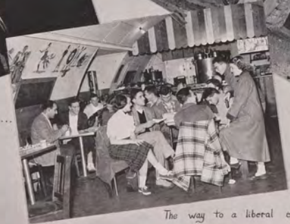
The way to a liberal education!!