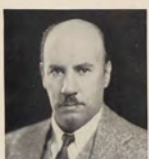
Igor I. Sikorsky