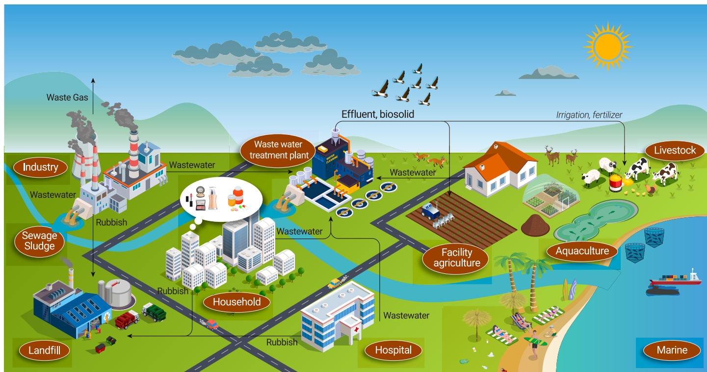
Figure 2. Schematic illustration of the multifaceted pathways of EC production, utilization, and environmental release Sectors such as industries, agriculture, households, hospitals, and wastewater treatment plants all contribute to the distribution of these contaminants. From industrial processes to agricultural practices and everyday household activities to medical and treatment facilities to effluent discharges, these sources collectively disseminate ECs into the environment.

as persistent using cutoff values 87 because effective exposure duration increases when introduction rates from sewage or effluent discharge exceed the rate of degradation. 88 Efficient treatment of wastewater containing various chemical contaminants and pathogenic microorganisms remains a significant challenge in environmental engineering, 89 particularly in low- and middle-income countries.