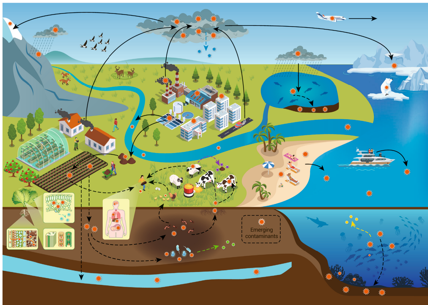
Figure 3. Pathways through which ECs enter the environment and their subsequent fate ECs can originate from various sources, such as industrial discharges, agricultural runoff, and wastewater effluents. Once released, ECs can undergo transformation processes such as degradation, volatilization, and bioaccumulation, influencing their distribution across different environmental compartments, including water bodies, soils, and the atmosphere.

wide range of pathogens or ARGs across diverse microorganisms present in samples. 198 Despite their high-throughput nature, the sensitivity of these methods relies heavily on the effectiveness of the analysis pipelines. 199 In recent years, computational tools have played a pivotal role in enhancing pathogen surveillance. Notably, the development of a comprehensive pathogen database has empowered the multiple bacterial pathogen detection (MBPD) pipeline to achieve holistic habitat surveillance and coinfections of pathogenic bacteria. 200 Moreover, advancements in understanding the genomic signatures of pathogens through deep-learning approaches, such as DCiPatho, have enabled highly accurate identification of pathogens on a genomic scale. 201 Despite the strides made in pathogen detection through sequencing methods, monitoring the environmental dissemination of high-risk ARGs, particularly originating from pathogen hosts, remains challenging and requires novel tools.