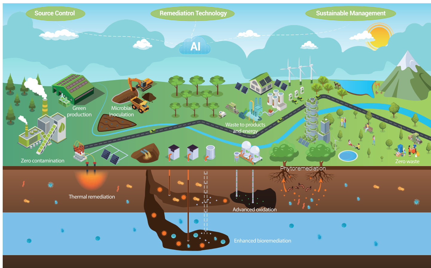
Figure 5. Strategies for controlling ECs encompass various measures, including pollution control at the source, sustainable remediation to clean up contaminated sites, and sustainable management practices to prevent contamination

the capabilities of machine learning to understand the reactivity of PFAS, which other researchers can leverage to predict and screen other environmental contaminants.