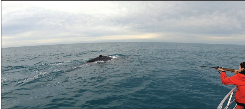
Figure 4: Annual biopsy sampling of humpback whales conducted under the Humpback Whale Sentinel Programme for circumpolar surveillance of the Antarctic sea-ice ecosystem