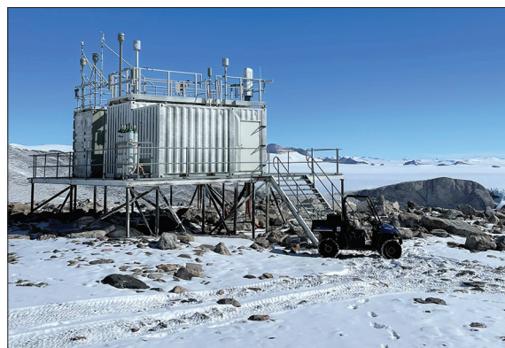
Figure 3: Norway's atmospheric observatory established in Queen Maud Land, Antarctica, in 2008

environmental factors, national political or scientific funding climates, and more recently, the global COVID-19 pandemic. Missed observations in a timeline substantially reduces the power of the dataset to detect change. As such, optimised chemical monitoring efforts should be simple, and, where possible, automated, with low associated logistical and financial costs, raising the feasibility of sustained measurements through societal stochasticity. Furthermore, where possible, these efforts should be integrated with, and ideally led by, national chemical monitoring programmes as ongoing commitments with clear lines of reporting against national and international policy obligations.