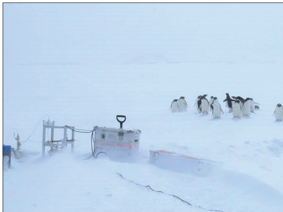
Figure 1: Targeted Antarctic field investigation of chemical redistribution in the coastal seasonal sea-ice zone during spring sea-ice melt