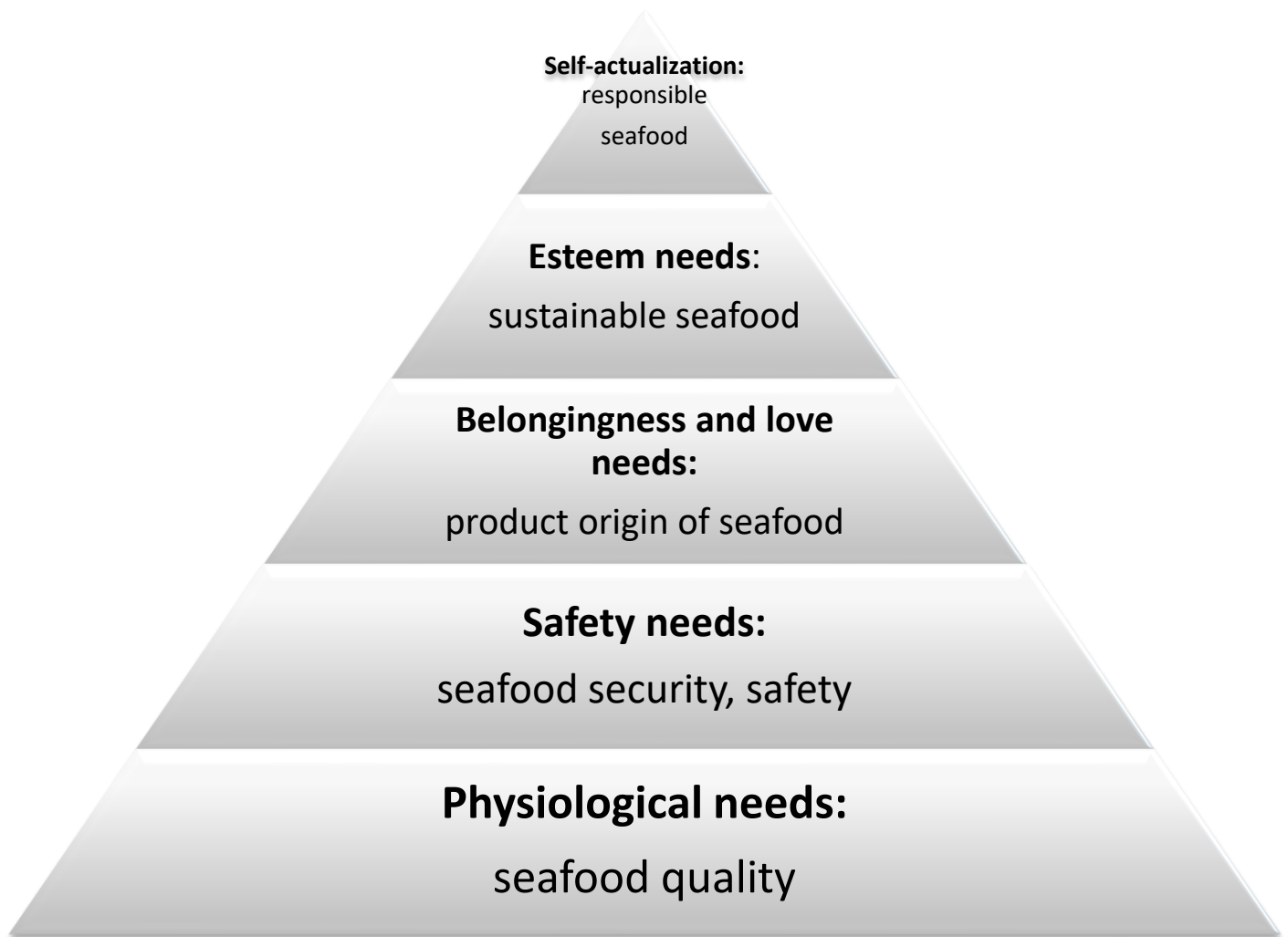
Figure 3.1. An Application of Maslow's Hierarchy of Needs to Seafood