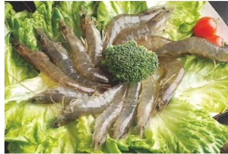
Domestic and Eco-labelled