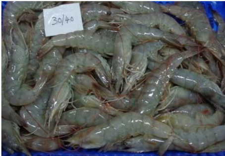
Imported and Non-labelled