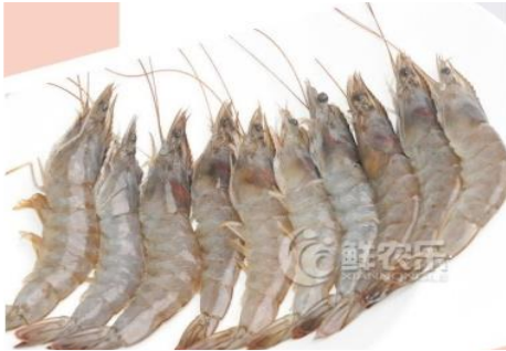
Domestic and Non-labelled