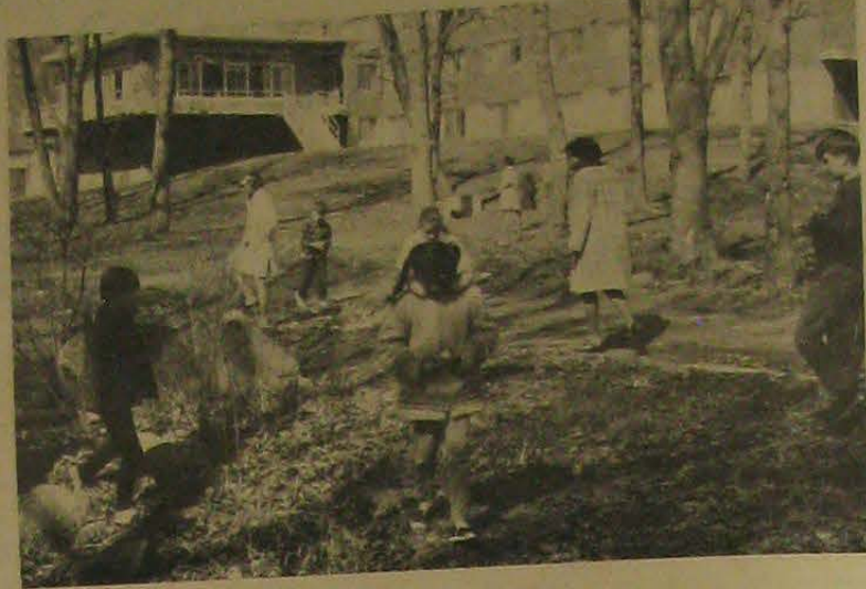
LITTLE BROTHERS AND SISTERS search for hidden eggs at last year's Easter Party

The Executive Board has made plans in hopes of further expanding the big brother program. A 1962 Ford Econoline van, donated by Marathon House and repaired by the URI maintenance department will alleviate transportation problems that previously hampered the program. Executive Board