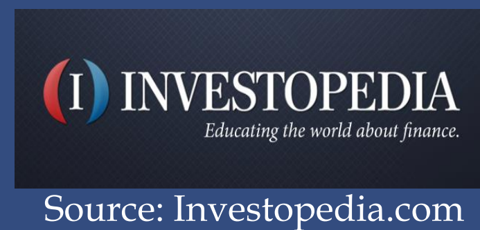
Figure 1. The simulator used for this project, consisting of both a stock trader and a currency trader amongst other educational tools for beginner and intermediate investors, and using only fake/simulated money.

There is money to be made in trading stock; quarter 4 of 2016 for example generated $267 billion in weighted-share earnings. But how difficult is it to turn a profit? The proper allocation of funds combined with the knowledge of where and when to invest can lead to substantial profit. My short-term investing project, focuses on the generation of profit via trading stock. My goals are too predict the movement and volatility of stock to generate 3% growth over a 3-month horizon. I used a four-part analysis technique in attempt to achieve this goal.