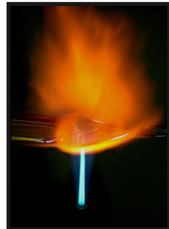
Lampworking a clear glass rod.