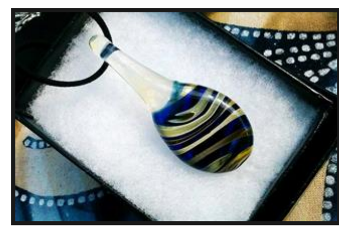
Glass Pendant June, 2013

This project utilized a single-participant design through self-observation beginning with my first lampworking experience. Lampworking is a small-scale method of glassblowing, which is an art form where one shapes molten glass into a variety of items.