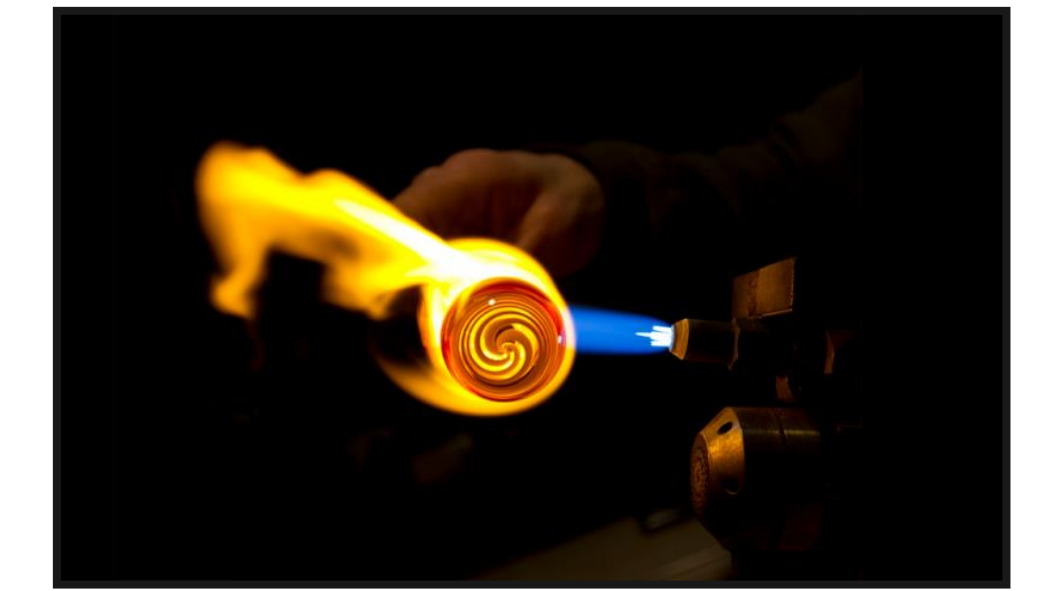
Lampworking torch melting a spiral design into glass.

With this project I sought to document the learning curve in an effort to illuminate the process for would be glass artists. Over the course of 14 weeks the number of mastered techniques increased from 0 at week 1 to 40 at week 14.