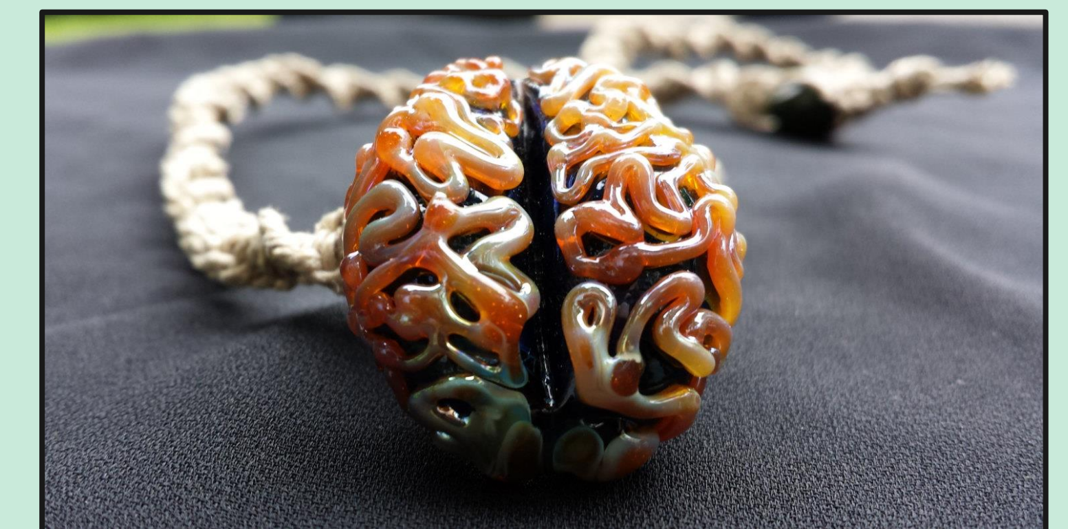
Glass Brain August 2013

Glassblowing requires a complex set of skills. With practice, one can observe the individual development, mastery, and automaticity of each skill during progress into glass artistry.