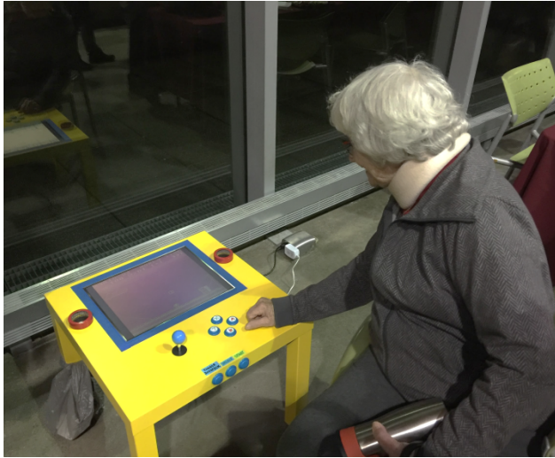
Figure 3. Accessible Arcade Table.