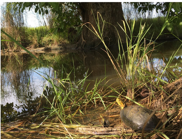
FIGURE 1 Adult Southeast Asian box turtle ( Cuora amboinensis ) near an ephemeral wetland in savanna, Rawa Aopa Watumohai National Park, South East Sulawesi, Indonesia. on 25 April 2018

In addition to their roles as predators and scavengers in aquatic and terrestrial habitats and moving nutrients between ecosystems, C. amboinensis are likely prey for birds and mammals in our study area. Although we did not document instances of predation, C. amboinensis , and particularly eggs and hatchlings, have been documented as prey of crocodiles, monitor lizards, wetland birds, and mid-sized mammals, such as civets (Moll & Moll, 2004; Stanner, 2010). Given that this turtle has a hinged plastron, or lower shell, and can