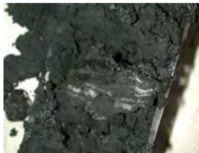
Figure 4. Methane hydrate (white patches) in freshly drilled, organic-rich, methane-supersaturated deep subsurface sediment (Peru Trench, ODP Site 1230, 5086 m water depth, 96 m below seafloor).

Core recovery (quality and quantity): Coring technology should be optimized to increase quality and, when possible, to increase quantity of material. Advances from industry and from ODP experiments can be leveraged to achieve this goal. Approaches to minimize drilling disturbance and fluid circulation include alteration of existing drilling practices (e.g., use of mud motor, “drilling over” to extend use of hydraulic piston corers to great depth); monitoring activity at the drill bit (to improve quality); bit/shoe redesign; and alteration(s) of core barrel and liners. These changes will greatly enhance the microbiological and biogeochemical value of cored material. For example, they will provide samples of crucial niches at geologic interfaces (e.g., lithologic contacts and fractured materials), and they will improve the rigor and quality of downstream analyses.