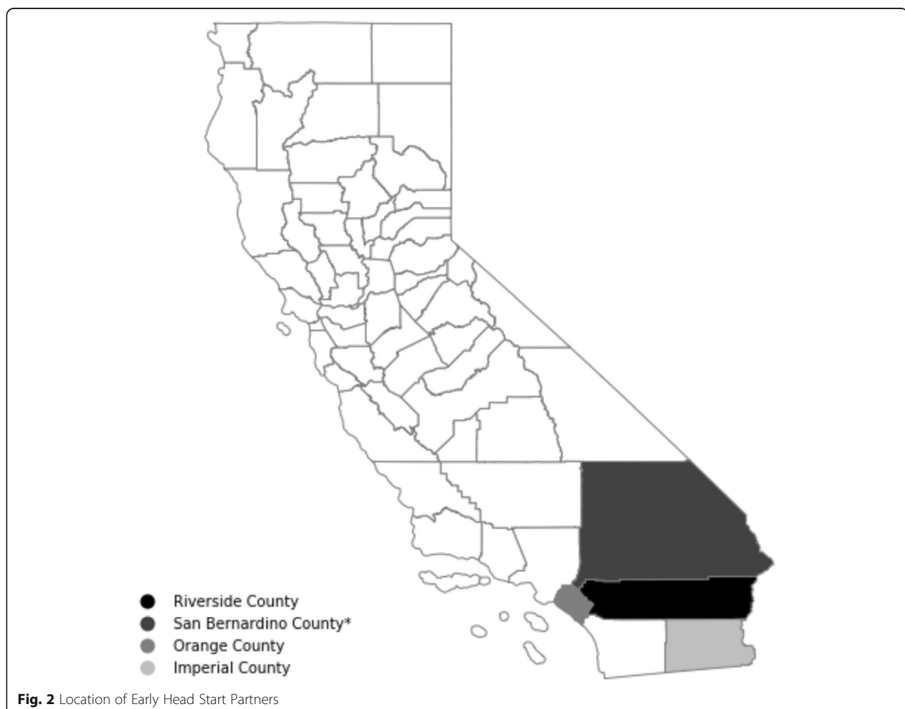
Fig. 2 Location of Early Head Start Partners

During in-person visits when infants are 2, 6, and 12 months of age, trained study team members will administer 1 individual face-to-face surveys with mothers