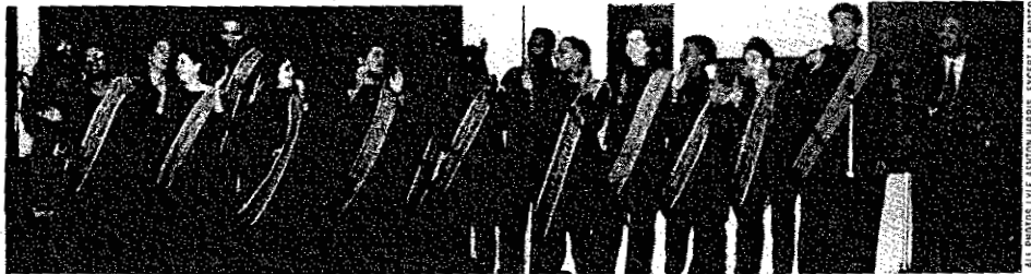
THE LAVENDER LIGHT GOSPEL CHOIR

In March 1995, a historic three day conference, "Black Nations/Queer Nations?," took place at the Graduate Center of the City University of New York. The conference brought together over 500 people to analyze the political, economic and social environment in which communities of the African Diaspora have not only survived, but continue to fight for the right and dignity to live, work and love as lesbian, gay, bisexual and transgendered people.