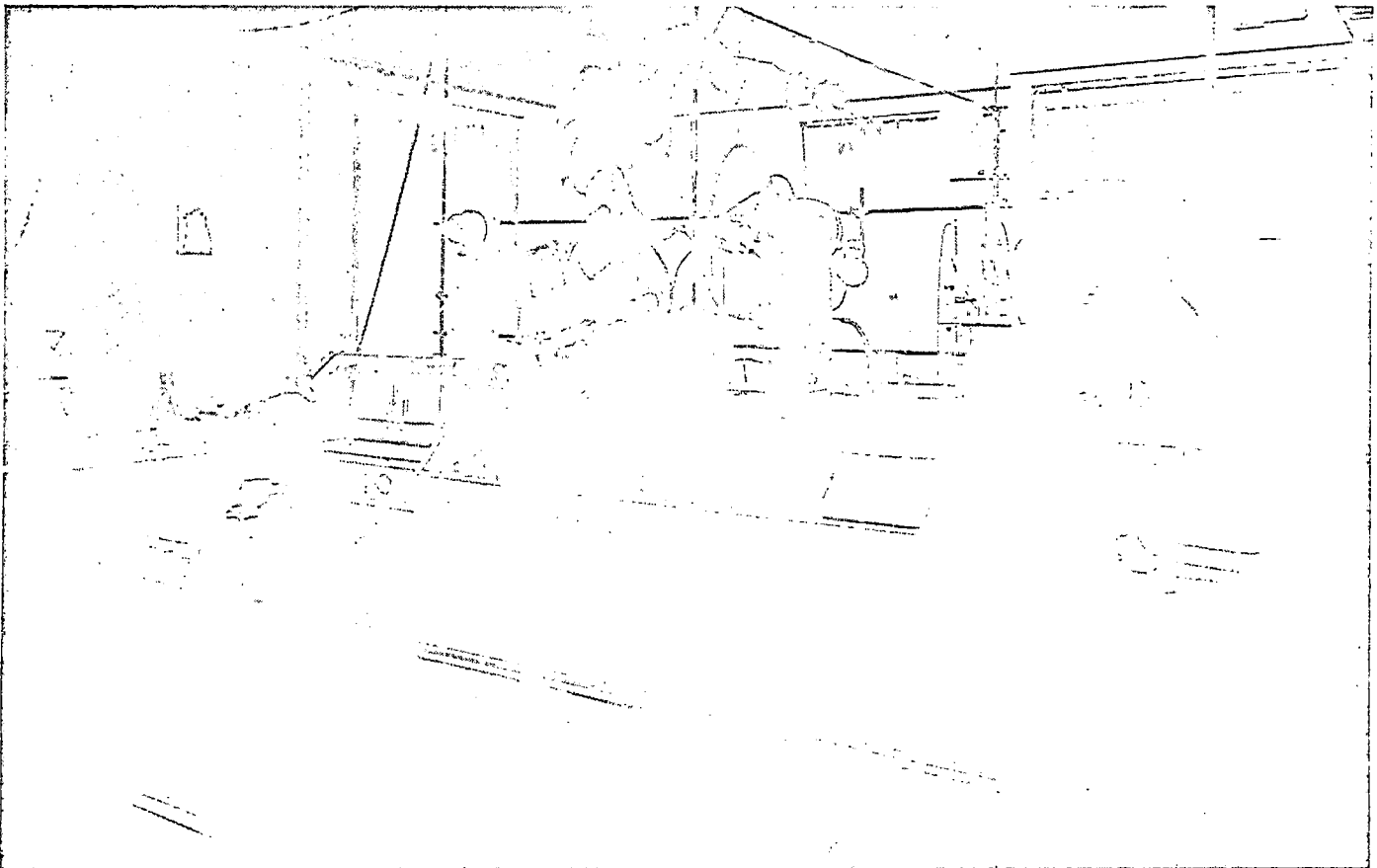
The Swiss National Museum in Zurich has recently established a large laboratory with modern scientific equipment. This is a small pilot plant for studying a method for preserving wet wood from archeological excavations with Carbowax.

To fill this need for trained manpower is what the new Conservation Center at New York University aims to do. The Rockefeller Foundation grant will support the center entirely for five years, then the grant will taper off, and after another five years the center will have to find other means of support. Nearly the entire basement (formerly the kitchen and service areas) of the James B. Duke house at