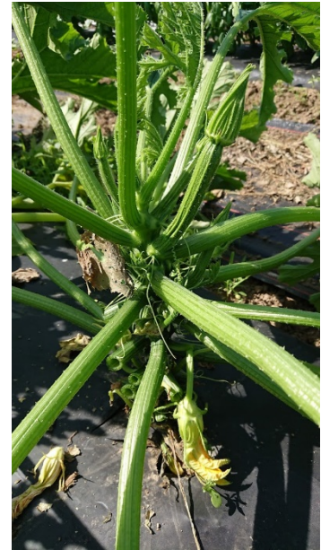
A plant of Pantheon on July 15. Note the upright growth habit and compressed internodes.

Growers are strongly encouraged to trial the new hybrid cocozelle varieties on their farms, as all of them out-perform Costata Romanesco. Pantheon was the top performer in this trial. It is a nicely compact plant with a good growth habit, and yields well with few wasted blossoms. Green Tiger yielded well but was challenging to harvest, and blossoms drop immediately after anthesis so the fruit could not be sold with blossoms attached. Cassia would be the best choice for selling Italian-style with the blossoms attached, as the fruit are very long and thin, reaching six inches at anthesis. Plants are compact like Pantheon, but with more basal branching,