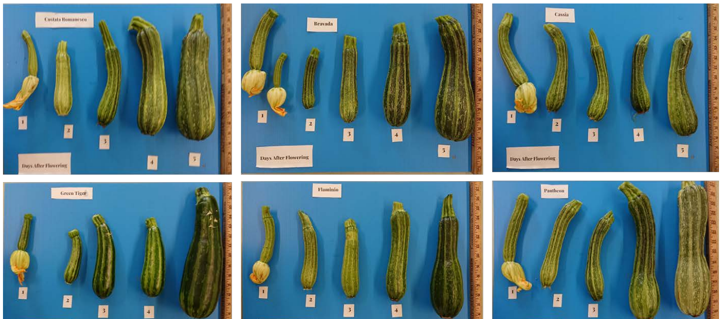
Fruits from the six trial varieties showing development over time. Seed development is noticeable by 5 days after flowering.