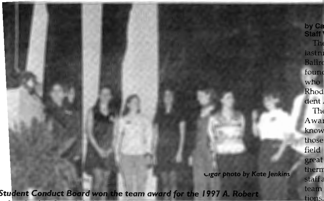
Cigar

ity Student Conduct Board won the team award for the 1997 A. Robert Student Leadership Awards held in the Memorial Union Ballroom last night.