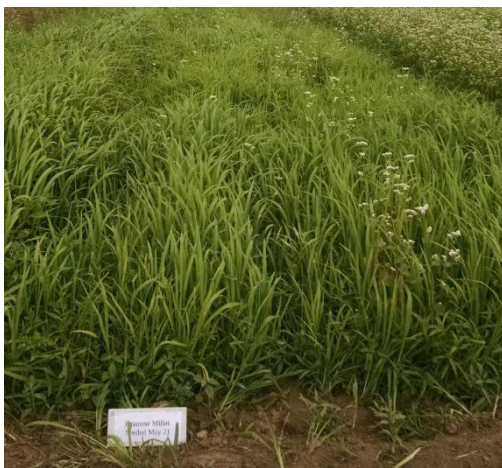
Figure 3. Japanese millet seeded May 21, 2015 into 61°F soil. Based on samples collected July 1, this planting produced 1200 lbs/acre of Japanese millet dry biomass. Photographed July 8, 2015.

Japanese millet seed will germinate with a soil temperature of 60°F at 2 inches depth, but growth rate and weed suppression are best if seeding is delayed until soil temperatures reach 70°F. In Rhode Island, seeding Japanese millet from mid-June to mid-July produced the most biomass. Vegetative growth rate in Japanese millet is strongly influenced by temperature, with plants growing faster at warmer temperatures (Muldoon et al. 1982). Vegetative growth stops at flowering. Japanese millet is a