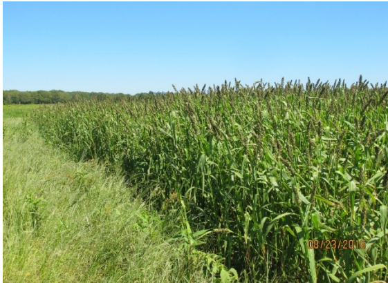
Figure 1. Japanese millet seeded June 24 and photographed August 23. Dry biomass in this planting exceeded 5 tons/acre.

In the United States the primary use of Japanese millet is as a feed for waterfowl and a component of wildlife meadow mixes (Shehan 2014). The seed is a preferred food source for ducks, doves, and