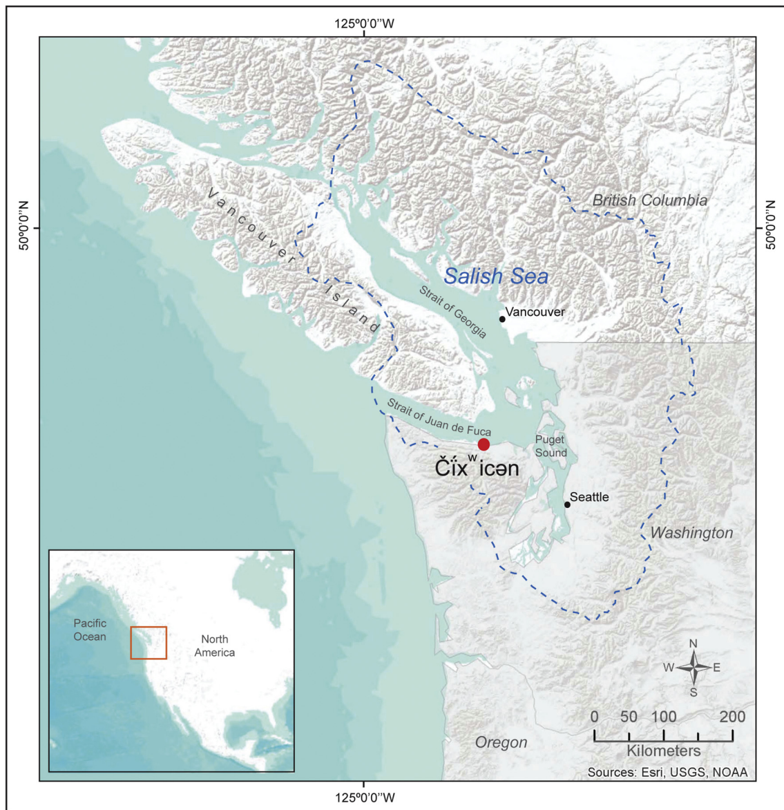
Fig. 1. Map of Northwest Coast showing location of Čixʷicən. Dashed line outlines the Salish Sea watershed. (Figure drafted by Kendal McDonald.)

encompasses concepts and methods from historical ecology and resilience theory to build an integrated deep history of human-environment interactions (Fitzhugh et al., this issue; Kirch, 2007; McGlade, 1995).