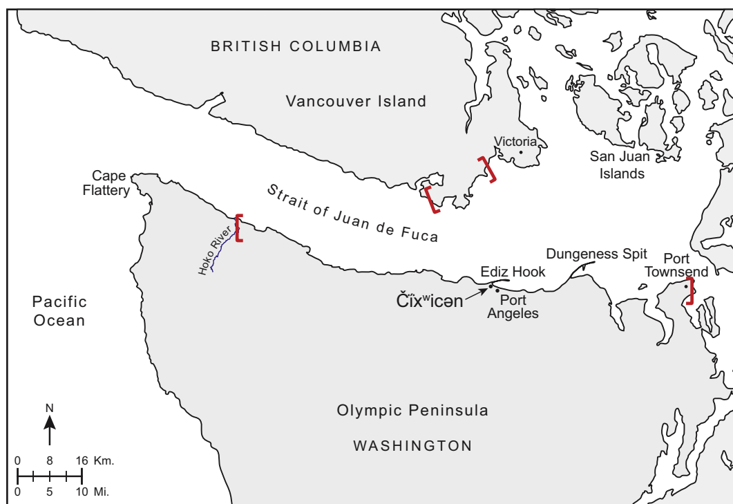
Fig. 2. Location of Čix'wicən village in regional context. Brackets show spatial extent of Klallam villages, mid-19th century (28 are on southern shore of Strait of Juan de Fuca located between Hoko River and Port Townsend; 5 are on northern shore of the Strait, on Vancouver Island) (LEKT, 2017a). (Figure drafted by Adrienne Cobb.)

Shaffer et al., 2004). Like other Northwest Coast societies, Klallam people lived in villages consisting of large plankhouses typically arrayed in one row, located on bays and estuaries for ready access to marine resources (Gunther, 1927). Plankhouses were the center of social and economic activities, food preparation, consumption and sharing, manufacturing, and ritual, as well as being the principal food-storage areas for resources such as dried salmon and other fish, cured whale, seal, and sea lion blubber and oil, and dried berries that were vital for winter survival (Ames and Maschner, 1999; Drucker, 1965). Travel for social interaction and resource procurement at fishing stations, hunting and gathering grounds, and other settings was accomplished primarily by steam-bent dugout canoes (Ames, 2002; Ames and Maschner, 1999).