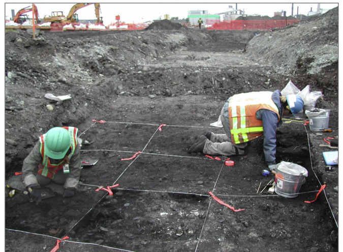
Fig. 4. Photograph showing archaeological excavation (foreground) in the dry dock project construction zone. Note the depth of fill between the modern ground surface (indicated by heavy machinery) and the pre-industrial, 19th century surface where field technicians Rene Casebeer (left) and Kim Kwarsick (right) are excavating. Photo #248, taken on May 25, 2004 by Sarah Sterling. Used with permission by Washington State Department of Transportation and the Burke Museum of Natural History and Culture.

For the large-scale excavation, both archaeological technicians and LEKT members were hired to excavate, water screen and work in the field laboratory. When human remains were encountered, a special set of protocols was followed that had been developed as part of the Treatment Plan; and modified over the course of the project in line with