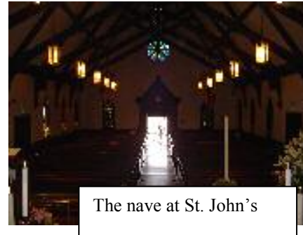
The nave at St. John's

In the nave of St. John's there are an abundance of stained glass windows but no clear paned windows. The windows present do not do much in terms of illuminating the church so the lighting comes from the front door when it is open