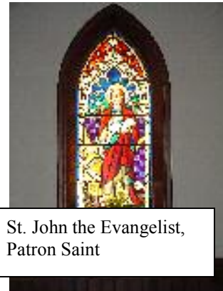
St. John the Evangelist, Patron Saint

impression of being somewhere important, somewhere out of the ordinary. What the window depicts also helps to set the mood of the church. It is not just a pretty design, but more often than not a relevant image to the religion or specific church. Whether it be a dove to symbolize the Holy Spirit or a shepherd's crook to symbolize Jesus, what is presented is a visual cue for what one is there for. The church makes use of these amazingly beautiful windows to not only manipulate the light but also to serve as indicators of the purpose for the church.