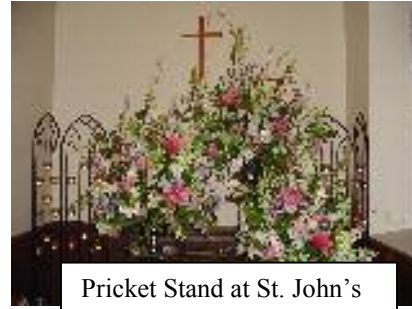
Pricket Stand at St. John's

Candles also can have a much more personal affect upon the ambiance of a church. Many churches contain a pricket stand, simply a stand made for placing votive candles during prayer. In St. John's the pricket stand is placed in an alcove on the northern wall of the church. It is a very small and personal space, giving off a very personal atmosphere. The use of candles serves to mystify the alcove, giving it a holy