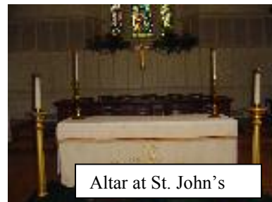
Altar at St. John's

If the liturgy of the Eucharist is the center of the church then the altar is the center of the Eucharist. It is here that the bread and wine are made ready for the congregation. The altar rarely is presented as just a table. There is usually a decorative altar cloth as well as ornate candles upon the altar. The