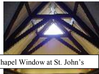
Chapel Window at St. John's

On the south side of the chancel there is a small chapel used for overflow and small services. From the nave it is just possible to see that there is no wall closing off that side of the chancel and that it is an open area. In this small