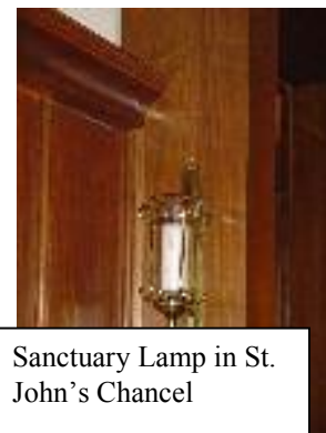
Sanctuary Lamp in St. John's Chancel

I find candles to be very amazing. Even in a well-lit room their presence has an effect upon the ambiance of that room. In a softly lit room, their presence is incredible. In the church candles are said to have multiple reasons. First they signify the presence of God. In the chancel there is a candle, called the Sanctuary Lamp, that is always burning to mark the constant presence of God within the church. Having a visual indicator of God's