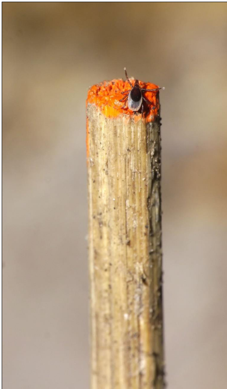
Fig 3. Ixodes scapularis nymph questing on stem in experimental arena. 1 cm of a 10 cm dowel is visible.