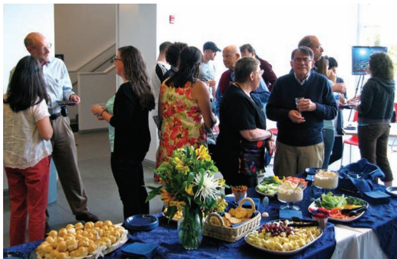
Reception in the Nautilus Cafe