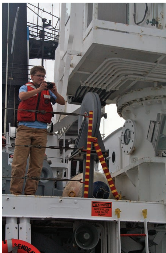
The author hopped aboard R/V Endeavor 's milestone 500th cruise as communicator, taking photographs, writing a blog, and issuing press releases.

I have set my own course along my career, not being constrained by tradition. And I know there are other alumni that feel the same. We have been prepared to follow our passion, whatever it may be, so let's take that leap over the flames. ■