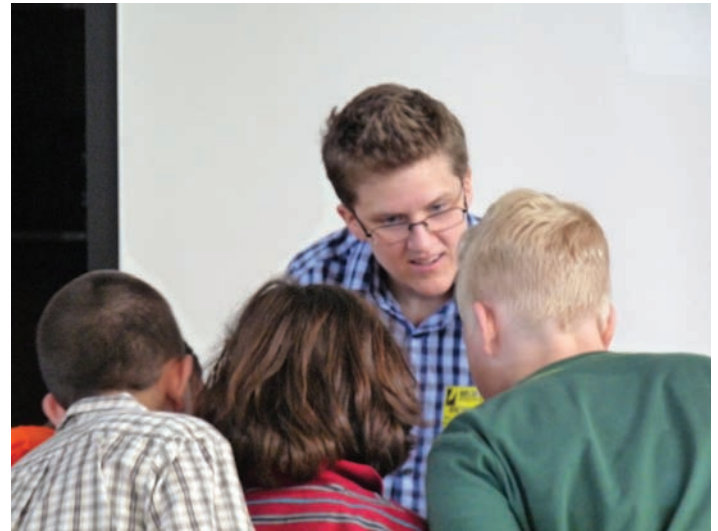
Sharing ocean science with elementary school children during a “Dive into the Ocean” presentation.

With a rip tide there’s always a pull, a not-so-subtle tug, threatening to sweep you out to sea. We all know, though,