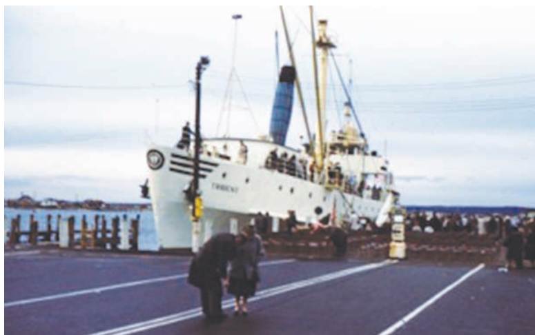
Trident Dedication, November 1962.