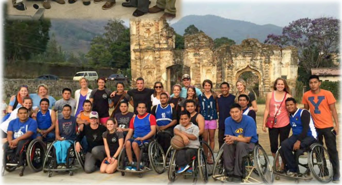
Pictured: Transitions Foundation basketball team in Antigua, Guatemala