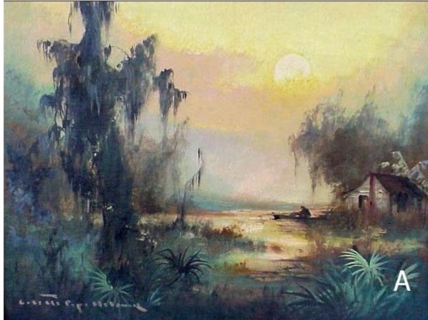
Fig. 5. Art as a manifestation of the inspirational values of coastal lagoons. (A) Swamp Idyl-Louisiana Bayou Country . Artist: Colette Pope Heldner (used with permission). (B) Gullah Fisherman . Artist: John W. Jones, Lowcountry, South Carolina (used with permission).