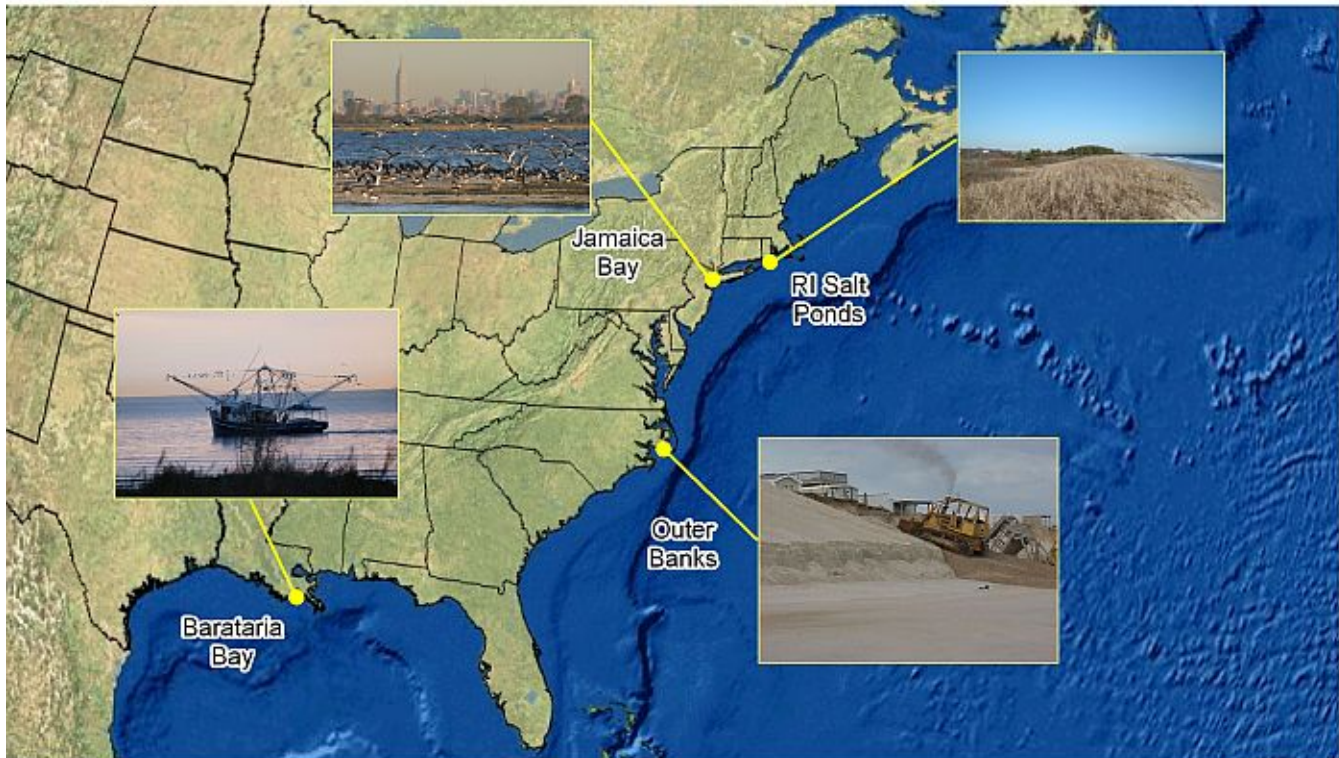
Fig. 4. Locations of the four lagoons used in the case studies of ecological and social values. Photograph inserts used with permission.

communities (Houma, Cajun, Creole, African-American, Vietnamese, and Canary Island Spaniards) share a single ecosystem (Gomez 1998, Tidwell 2003, Gramling and Hagelman 2005). These cultures share a high degree of poverty or economic uncertainty, leaving them more vulnerable to the effects of GCC (Rosenzweig et al. 2007).