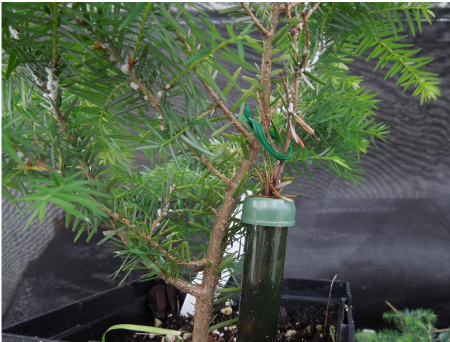
Fig. 1. Hemlock inoculation technique. Photo taken 6/19/2013.