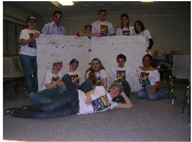
Above Left: Participants take in all the graffiti board has to say Above Right: Those who chose to stick around to break down the board!