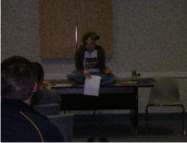
Above: Me, leading the first DOS meeting on 4/13

Right: Setting up our table in the morning was a little confusing without being able to speak!