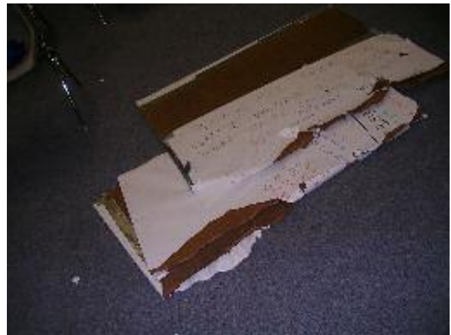
Breaking down the graffiti wall Not much was left of it when we were done.